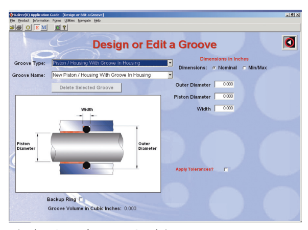
(Kalrez® Application Guide)

Guides are available through www.dupontelastomers.com.