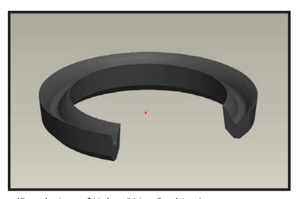
(Rendering of Kalrez® Vee Packing)